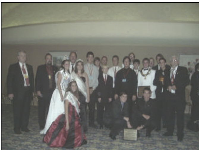
And Chapter of the Year goes to...WALT DISNEY!